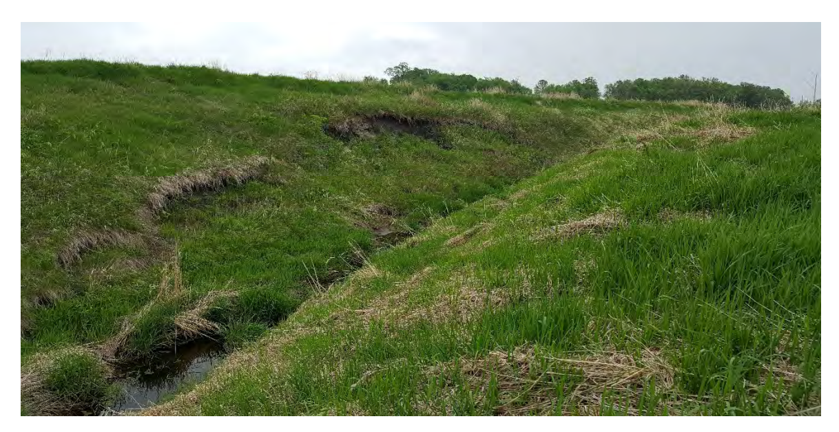
South 0f 370<sup>th</sup> St on Seneca land. Lots of sloughing.