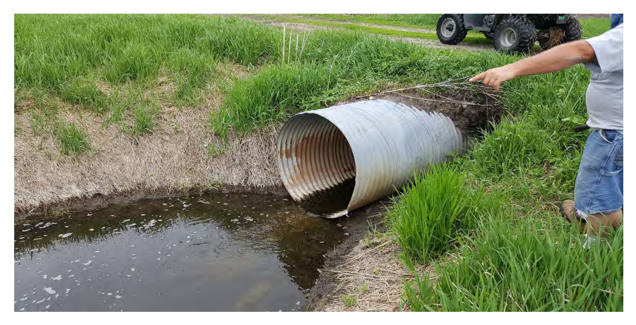
Culvert behind landowner's house. Eroding where the people are standing.