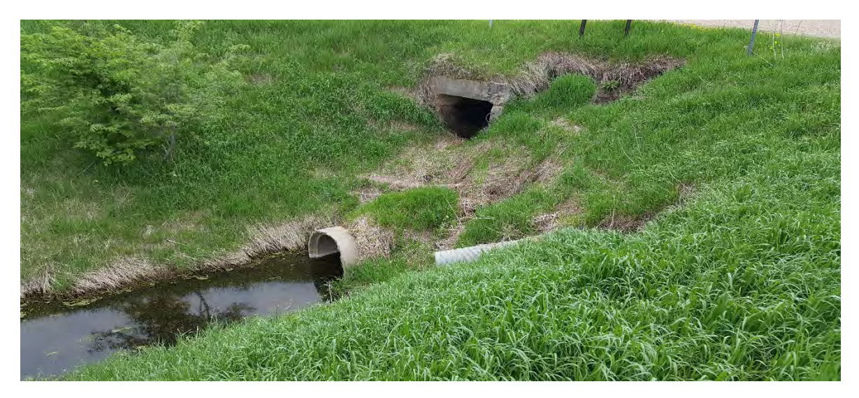
North side of 370<sup>th</sup> st. Cement culvert