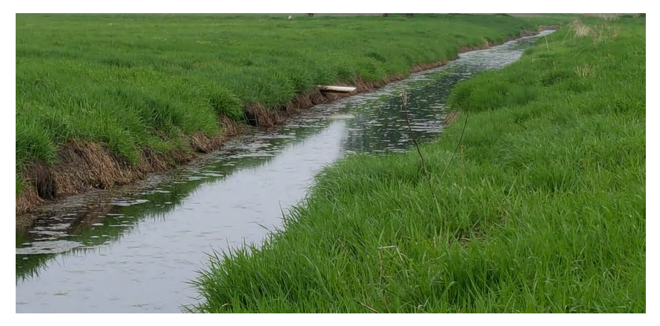
A look at field tile out letting into the ditch. The whole ditch looks like this.