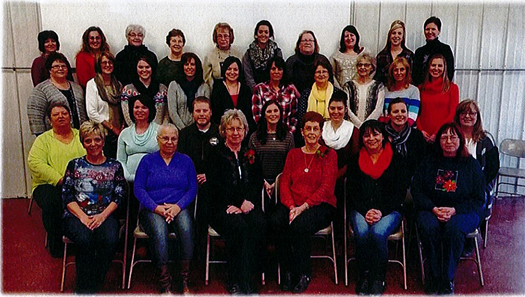
Le Sueur County Public Health Staff 2015