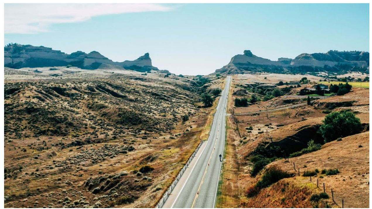
Sample of marketing photography taken during 2022 Monument Marathon.