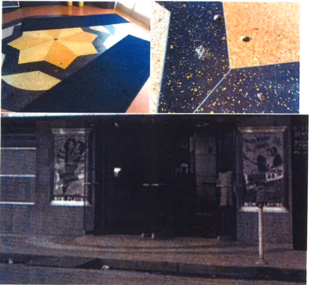
Photo 3: A vintage image of the entrance to the Midwest Theater, showing the arced color of the terrazzo sidewalk.

The joy of seeing the Midwest Theater marquee lighting up the night again and appreciating a faithfully restored grand theater! The value of this nostalgic, historically-important structure to the community cannot be understated. The Midwest Theater has been a grand part of the downtown Scottsbluff streetscape and community life for 75 years, and this project will help extend the life of the Midwest Theater to 150 years and beyond.