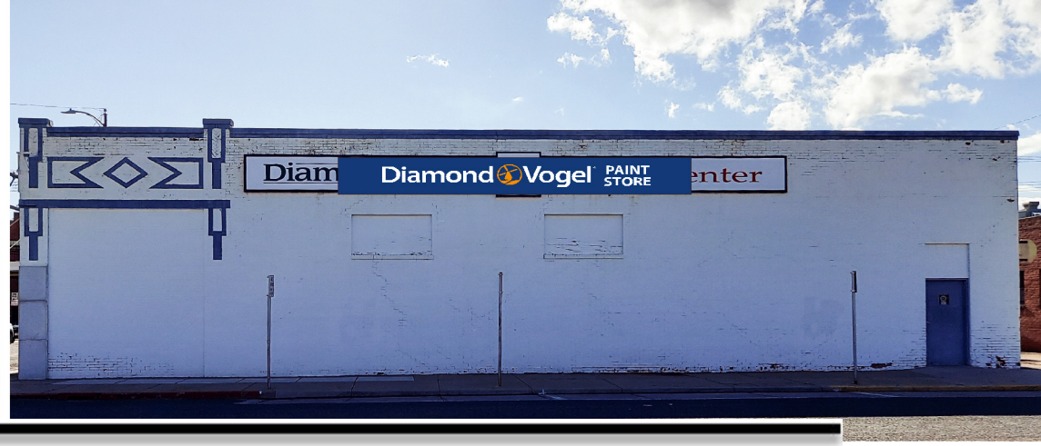
Regular Meeting - 7/19/2021