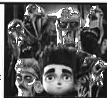
Para Norman PG Sat., Oct. 21, 3:30 p.m.