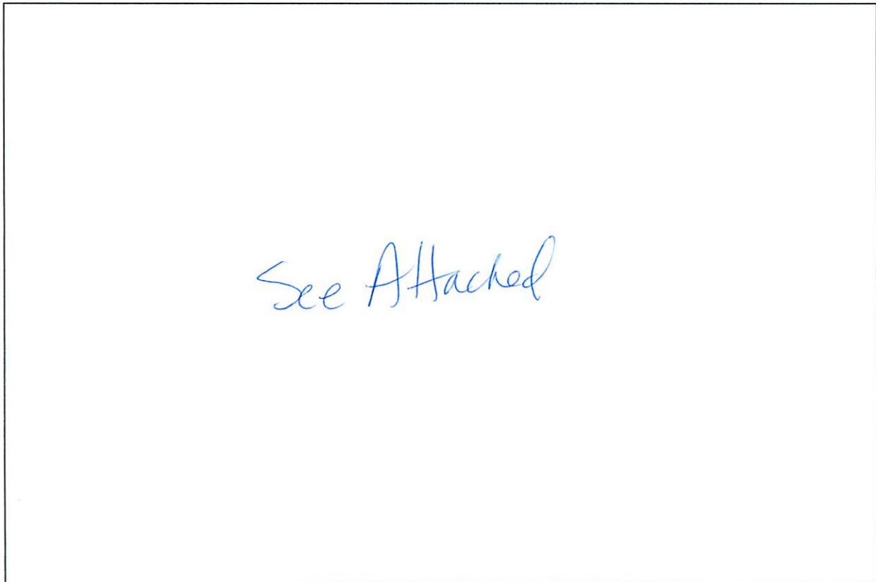
DIAGRAM OF PROPOSED AREA: