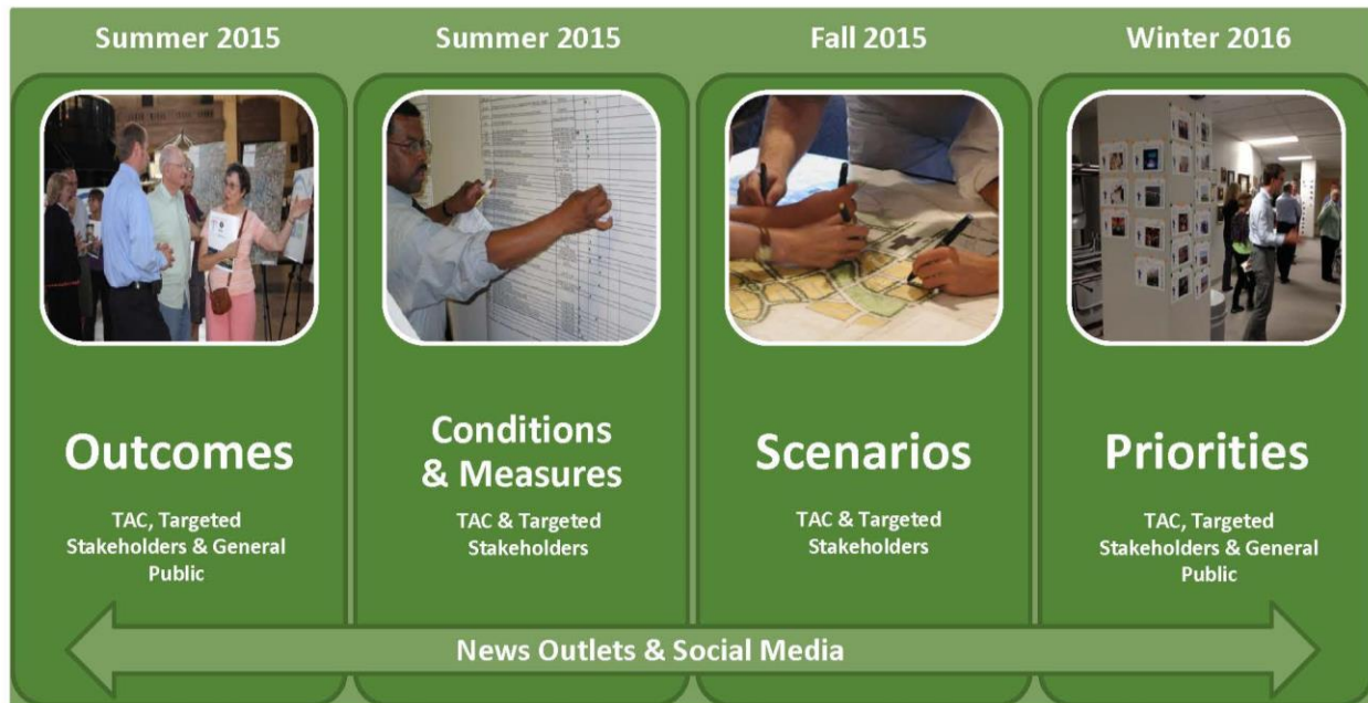
Figure 2 – JOURNEY 2040 Estimated Timing for Public Involvement

JOURNEY 2040's wide range of stakeholders will be engaged four meaningful and impactful times during the planning process as described in Figure 2 – JOURNEY 2040 Estimated Timing for Public Involvement .