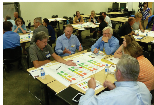
Stakeholder Workshop on August 10th

Stakeholder Workshop No. 2 was held on August 10, 2015 to discuss how the Grand Island area's network of roads, trails, and rail should perform for motorists, cyclists, walkers, and others over the coming 25 years in relation to potential goals and objectives for the JOURNEY 2040 plan. Workshop participants discussed the importance of developing possible goals and performance measures by mode of transportation, local initiatives for creating healthy communities, and the impact funding may have on the area's transportation aspirations.