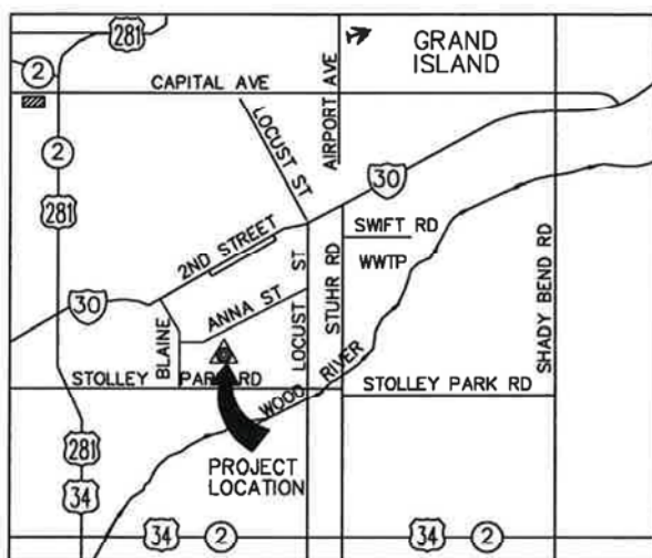
LOCATION MAP NTS

CIVIL LIFT STATION NO. 7 WATERSHED PROJECT PROPOSED GRAVITY SEWER REPLACEMENT