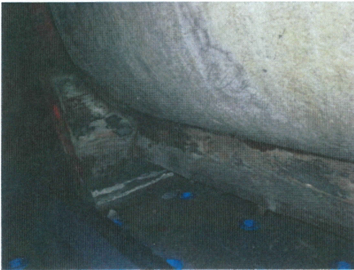
Figure 2 Thrust Block