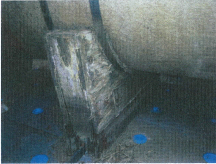
Figure 1 Pipe Saddle