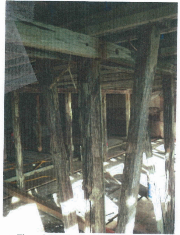
Figure 3 Distribution Pipe support column