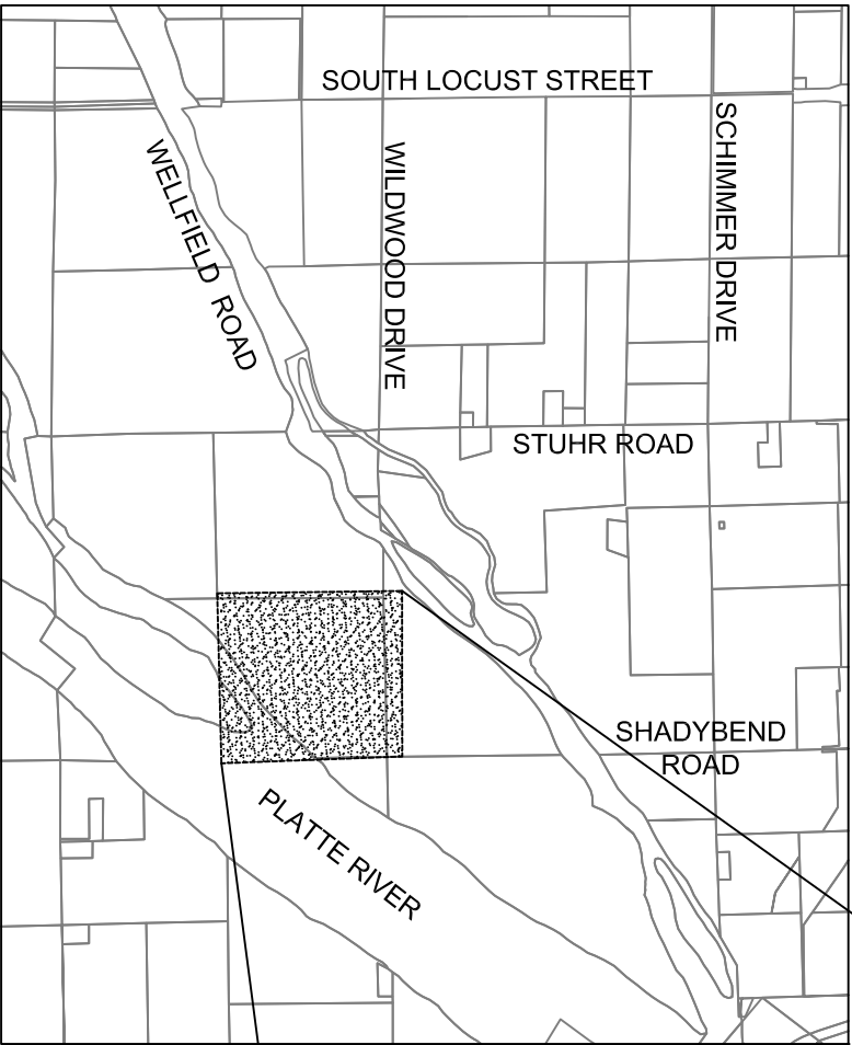
Contract 2008-WF-1, Project Location