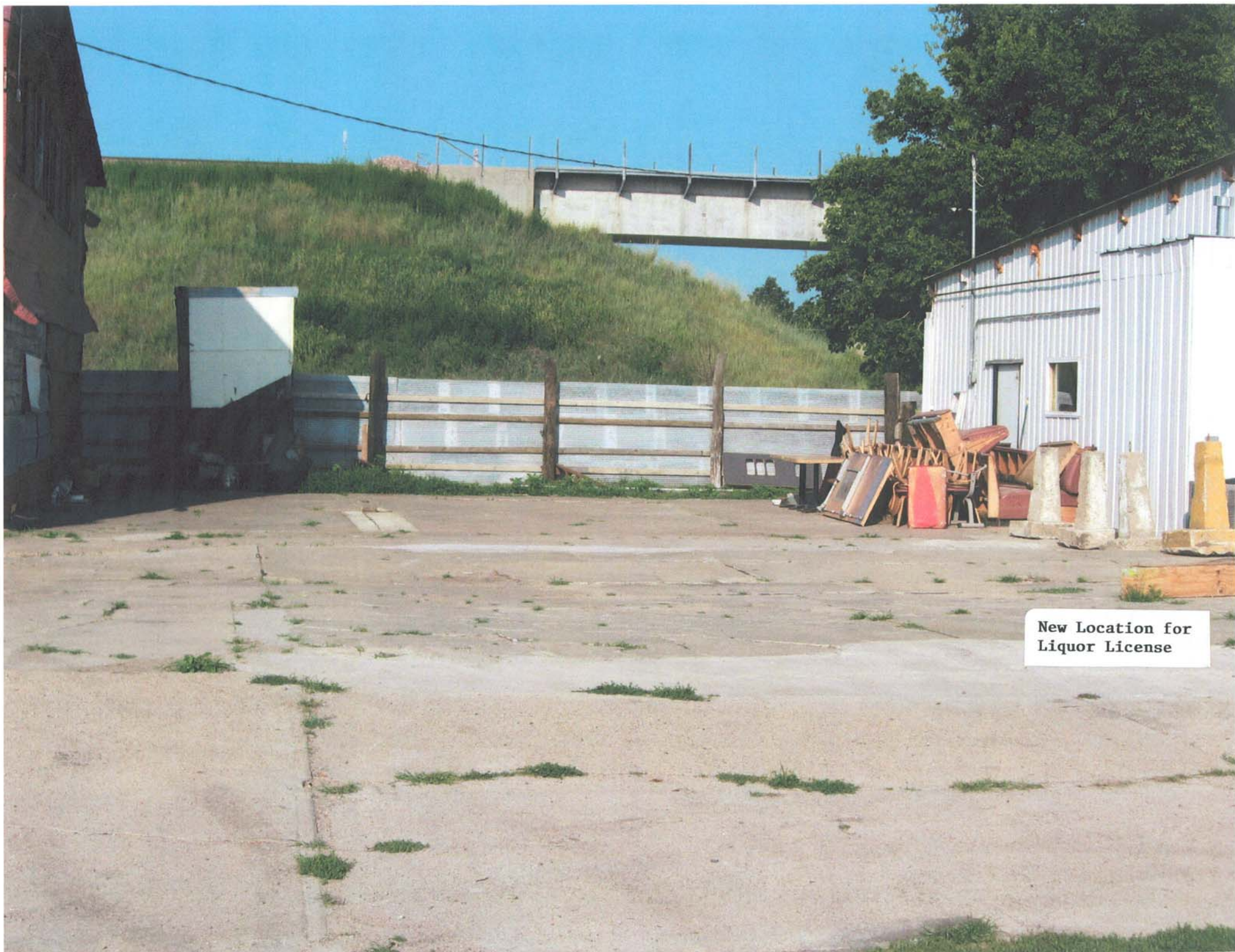
New Location for Liquor License