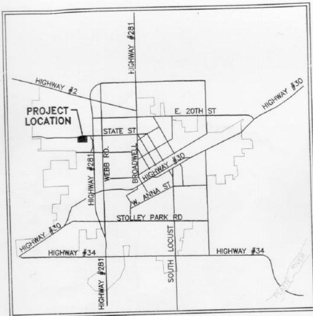
SITE LOCATION MAP (NOT TO SCALE)