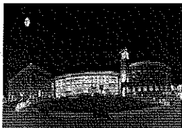
City Hall at Night