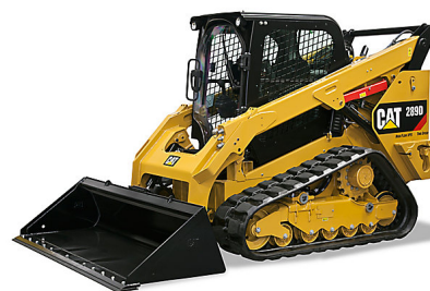
Examples of Compact Track Loaders