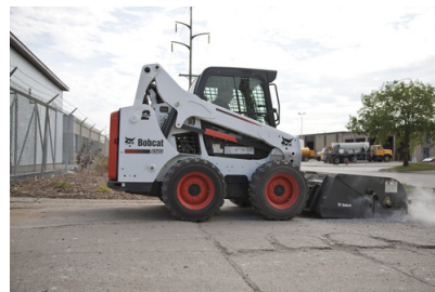
Examples of Skid Steer Loaders