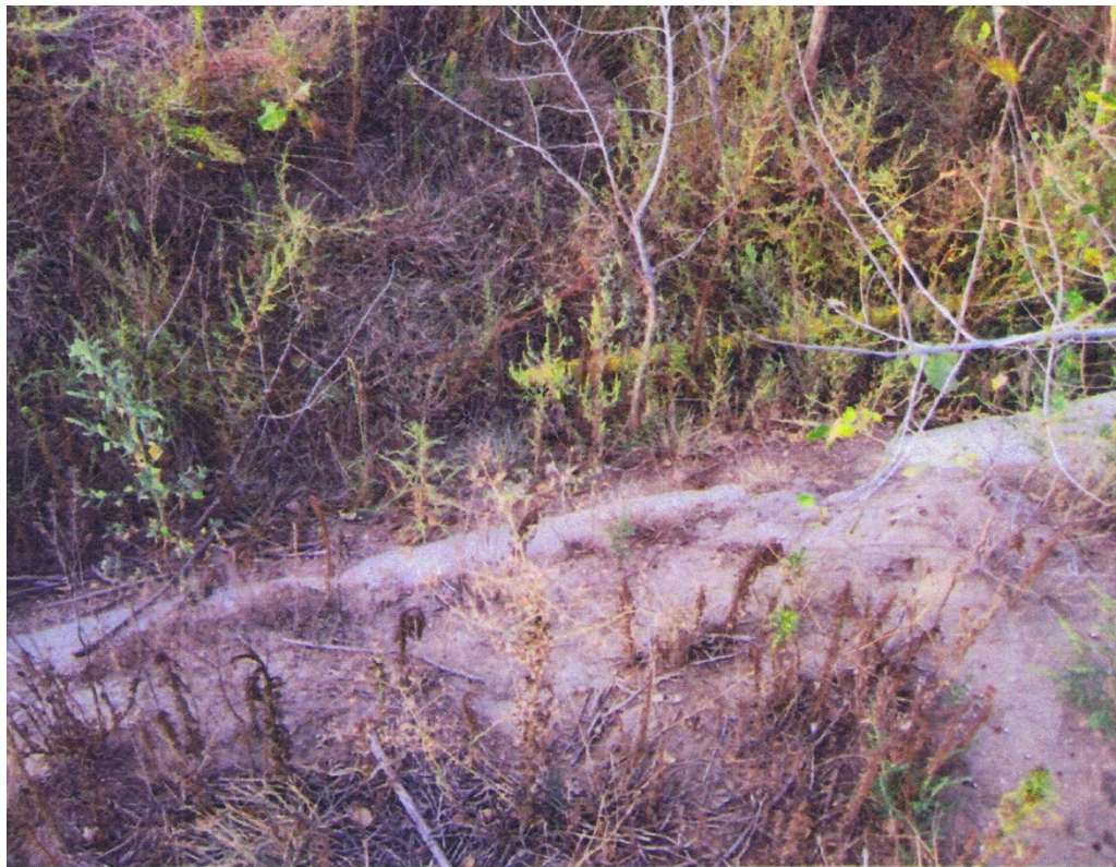
Storm sewer exposed and also gas line exposed.