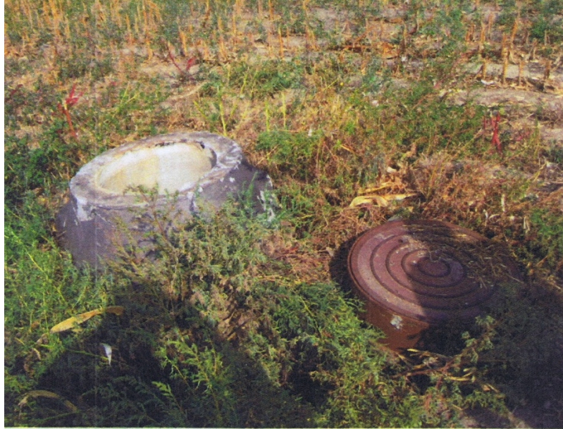
Sanitary sewer manhole.