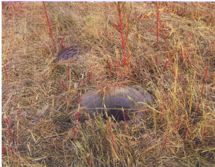
Sanitary sewer manhole.