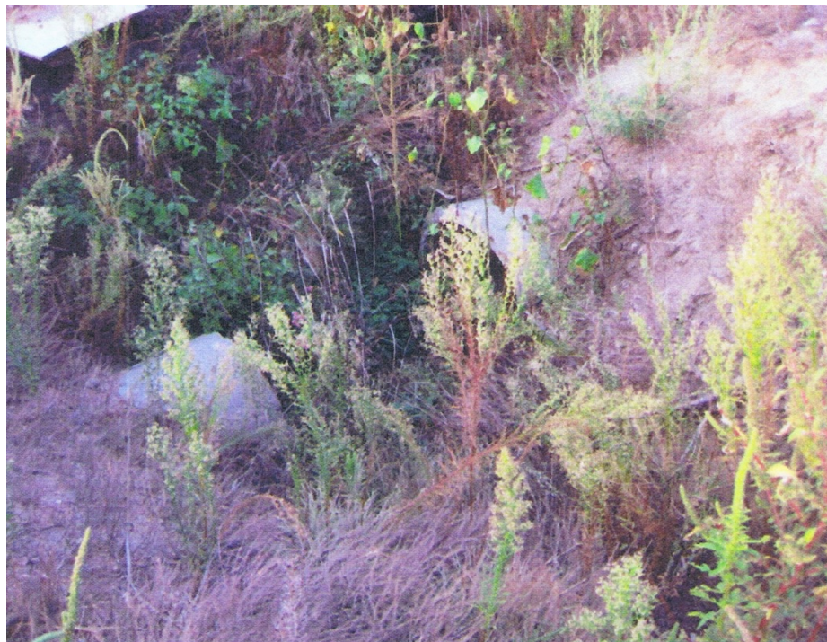
No catch basin