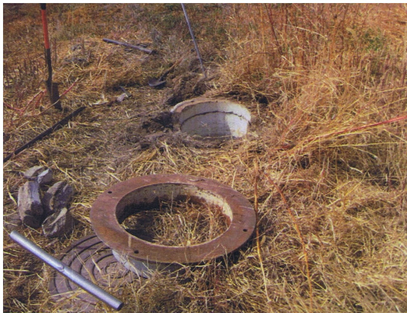
Sanitary sewer manhole.