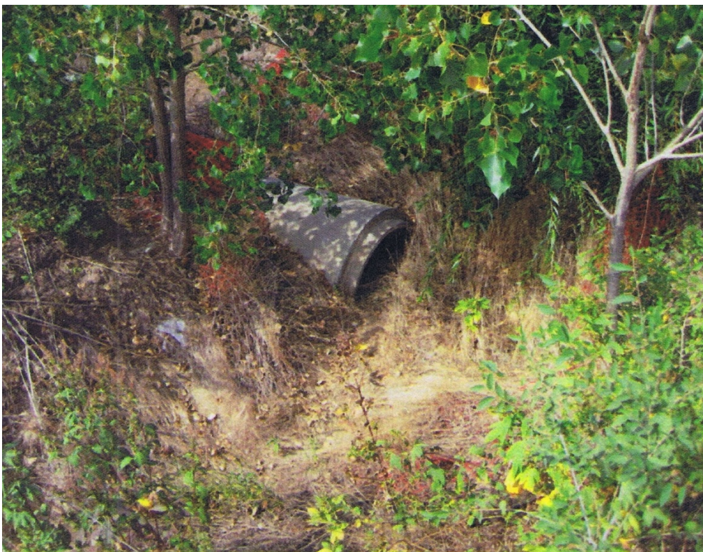
Strom sewer outlet. Hole dug out around pipe. About 100' west of Cherokee Ave.

The southern portion of this Analysis Area also exhibits problems with sanitation relating to inadequate surface drainage due to lack of a complete surface drainage system. As indicated in the photographs below, the incomplete surface drainage structures leave open swales and ditches where water ponds and stagnates, creating not only a physical, but potential health hazard for area residents due to increased potential for increased mosquito production.