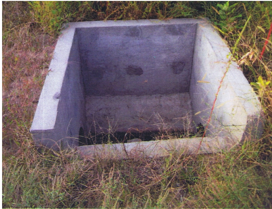
Top nowhere to be found.