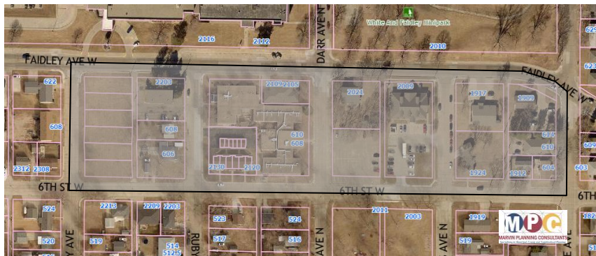
Figure 1: Study Area Map

Note: Lines and Aerial may not match.