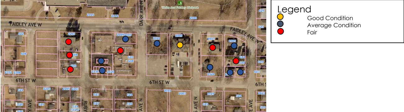
Figure 3: Structural Conditions

Note: Lines and Aerial may not match.