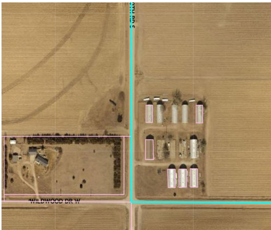
2022 Aerial View of the Property