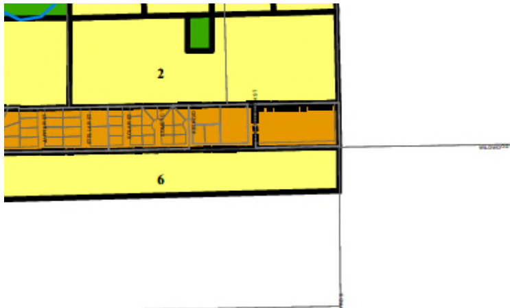
Future land use map as adopted Dec. 2003

The Village of Alda approved a future land use map as part of their comprehensive development plan on December 2, 2003. The Norma Cunningham Estate is requesting an amendment to the future land use map of for property located at the corner of 60 th and Wildwood. The amendment as shown on the attached map would declare the subject property as planned for light industrial developments. This property has been the location of as many as 13 Quonset type buildings since at least 1957 based on aerial photography archives.