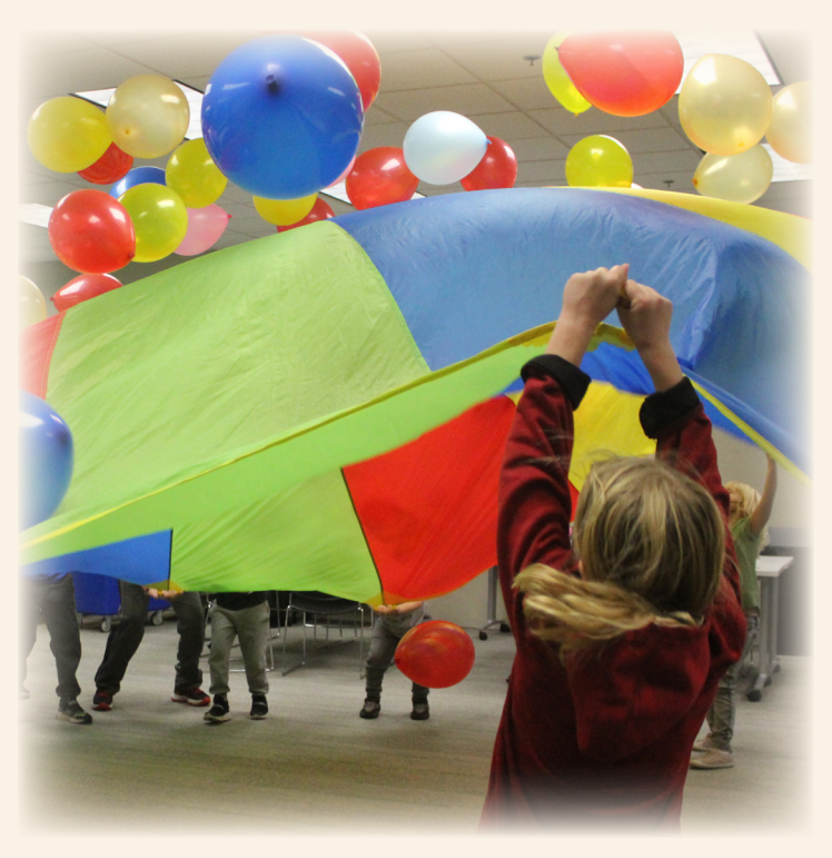
toolkit available for checkout and in-library use.

The ARPA Youth Grant also funded the purchase of six One by Wacom tablet input devices, two sewing machines, and an iFixit Pro Tech electronics repair