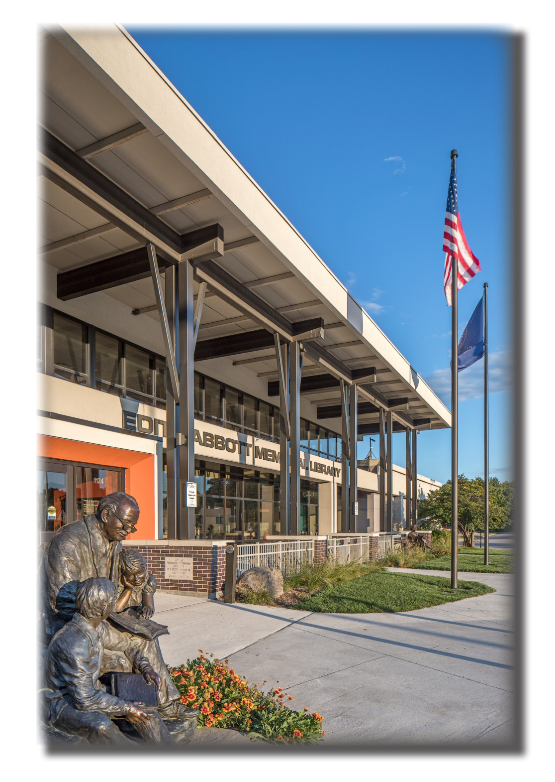
Library Mission Statement inspire and strengthen our comm

To inspire and strengthen our community by connecting people with information, ideas, and experiences