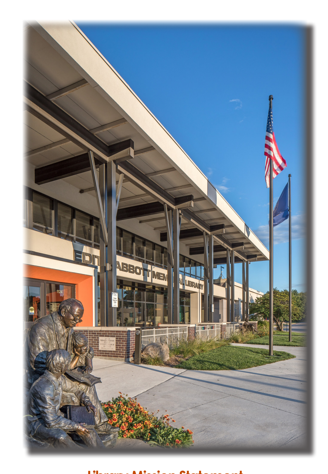
Library Mission Statement To inspire and strengthen our community by connecting people with information, ideas, and experiences