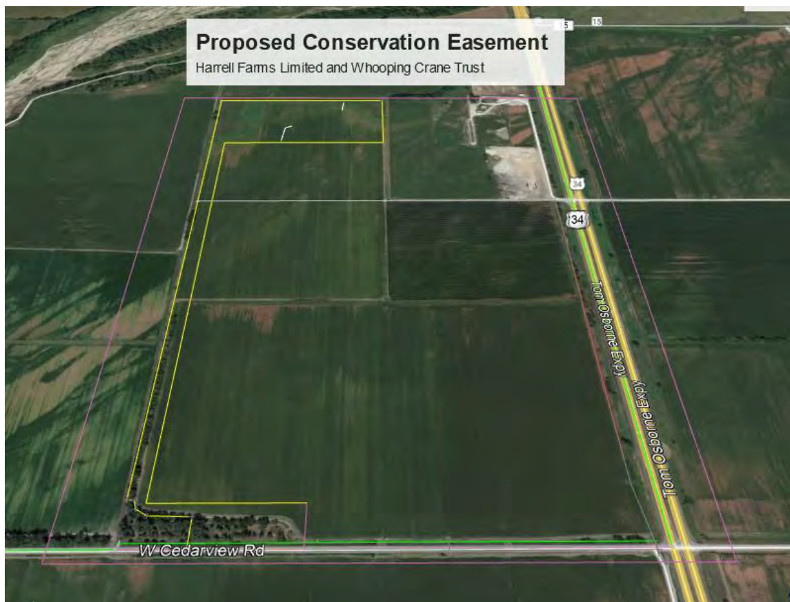
General Location of the the Proposed Easement

Existing land uses: North Farm Ground and River East Cattle Feeding Operation West and South: Farm Ground