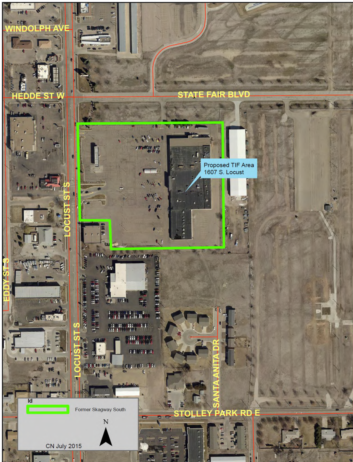
CRA Area 2 Redevelopment Plan Amendment 1607 S. Locust April 2021