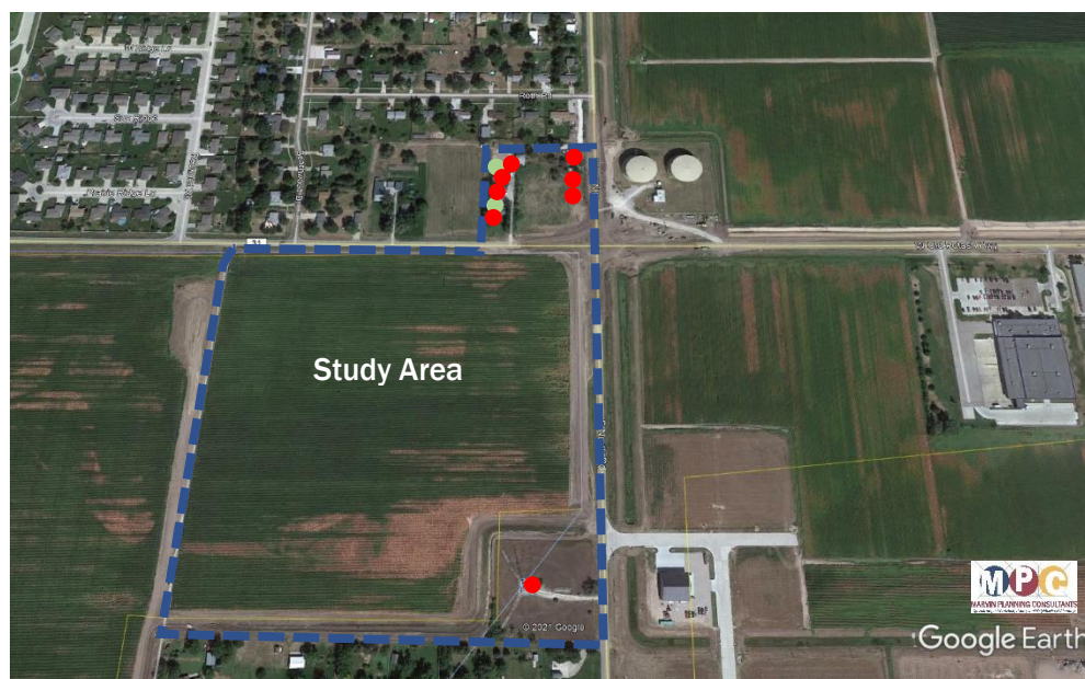
Figure 8: Age of Structures