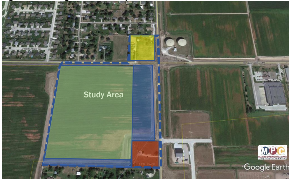
Figure 2: Existing Land Use Map