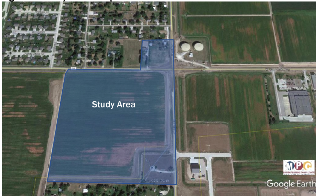
Figure 1: Study Area Map