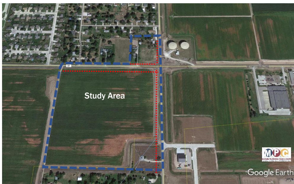
Figure 6: Curb and Gutter Conditions