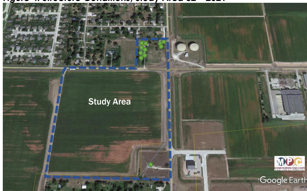
Figure 4: Structure Conditions, Study Area 32 – 2021