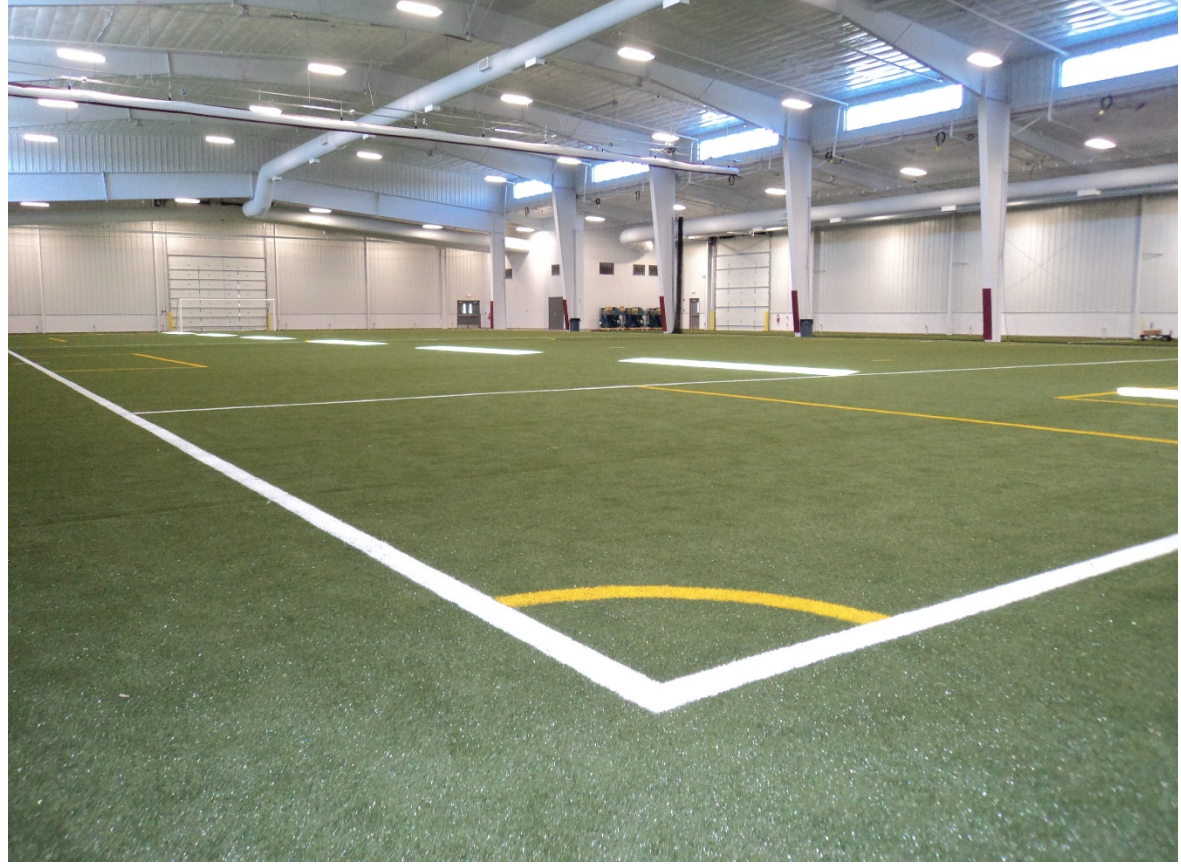
14 | Page