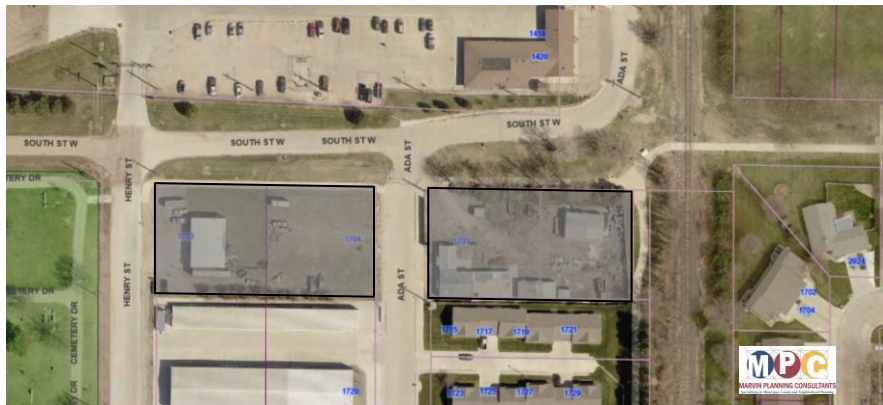
Figure 2 Existing Land Use Map