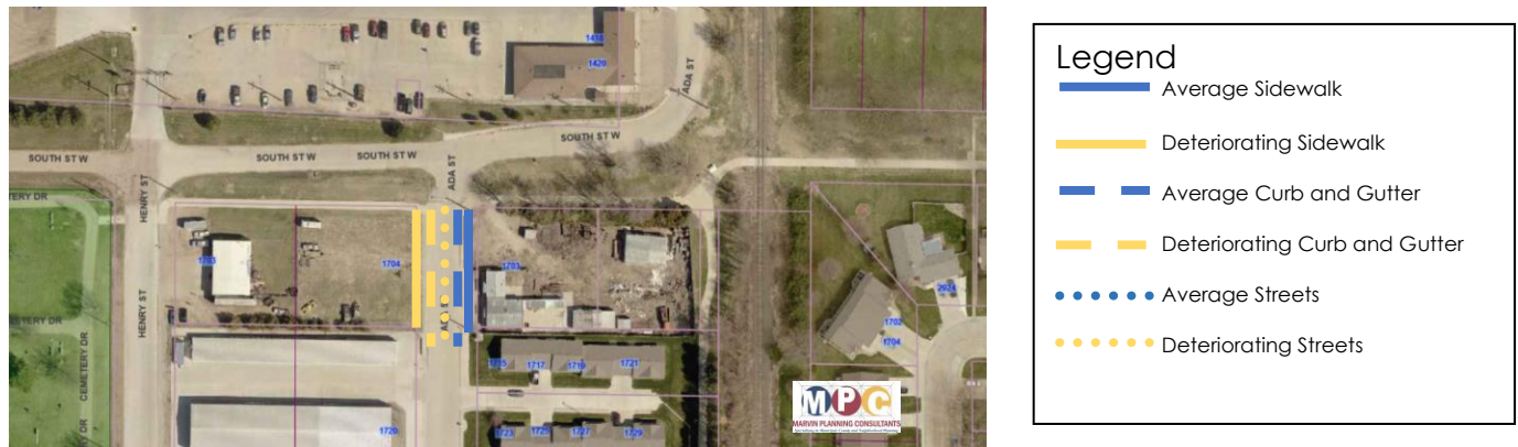
Figure 4: Deterioration of Site or Other Improvements