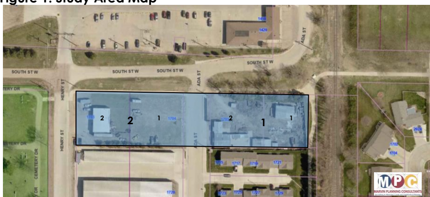
Figure 1: Study Area Map