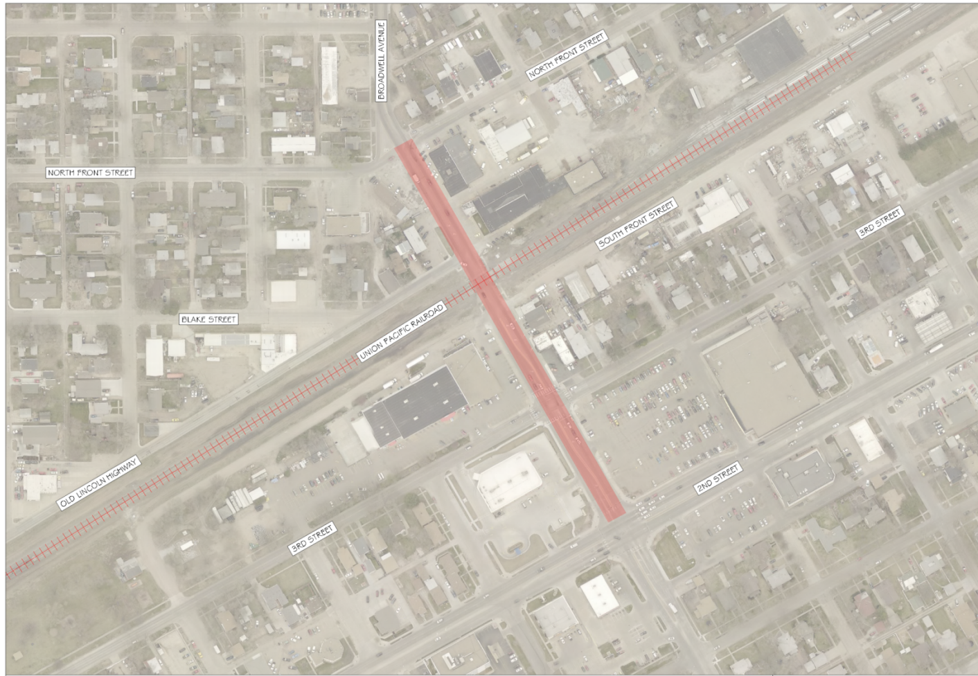
UNION PACIFIC RAILROAD & BRODWELL AVENUE GRADE SEPARATION FEASIBILITY STUDY

2018 - 2019 CAPITAL IMPROVEMENT PROJECTS