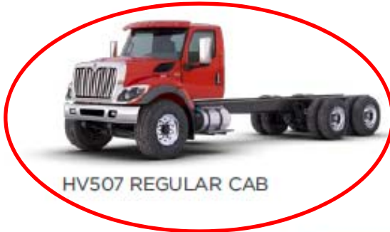
HV507 REGULAR CAB