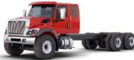
HV507 EXTENDED CAB