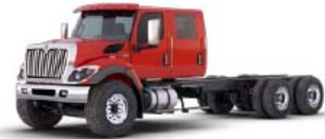
HV507 CREW CAB