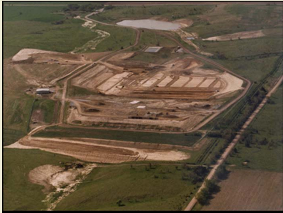
Landfill on Husker Hwy @ Hall / Buffalo County Line