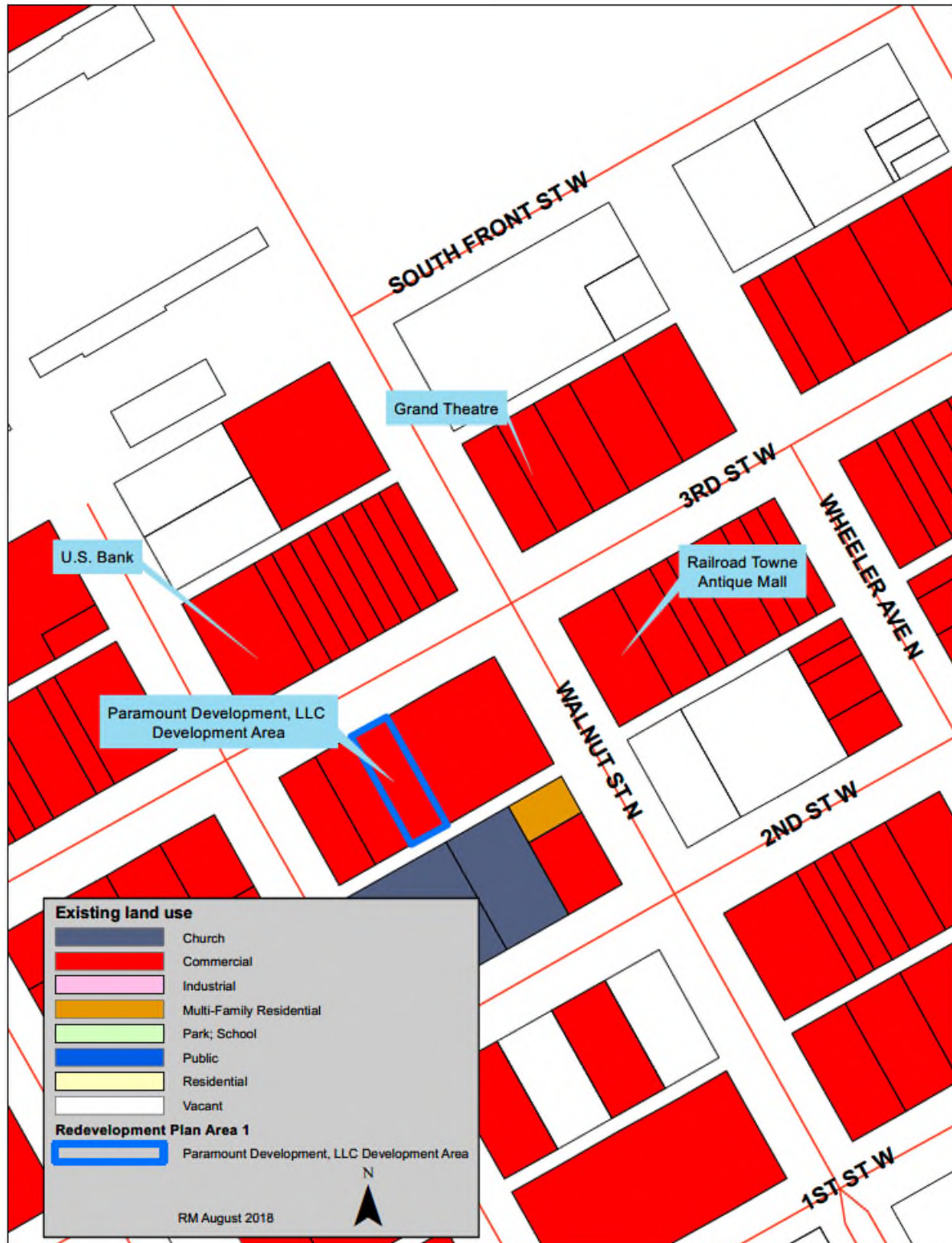
Existing Land Use and Subject Property

Legal Descriptions: The first floor of the building on the easterly 44 feet of Lot Three (3) in Block Sixty-Three (63) in the Original Town, now City of Grand Island, Hall County, Nebraska.