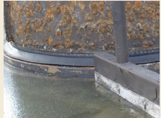
Corrosion in Clarifier