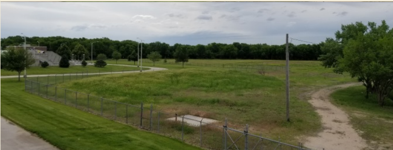
View WWTP of Back Lot