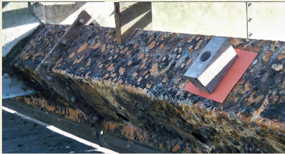
Anodes inhibit corrosion