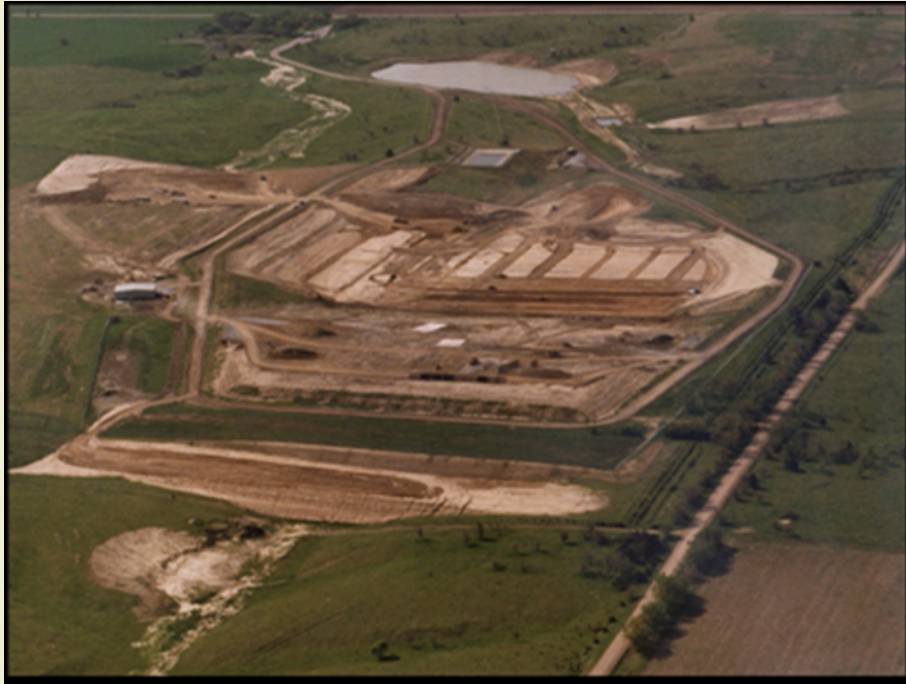
Landfill on Husker Hwy @ Hall / Buffalo County Line