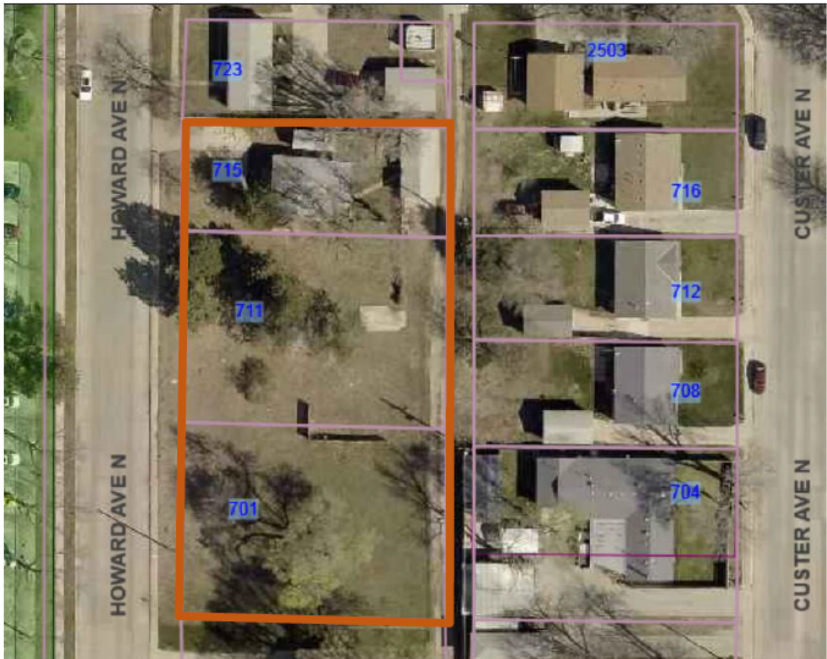
Figure 1: Study Area Map