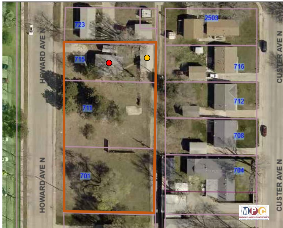
Figure 5: Unit Age Map