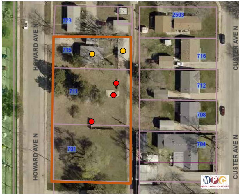
Figure 3: Structural Conditions