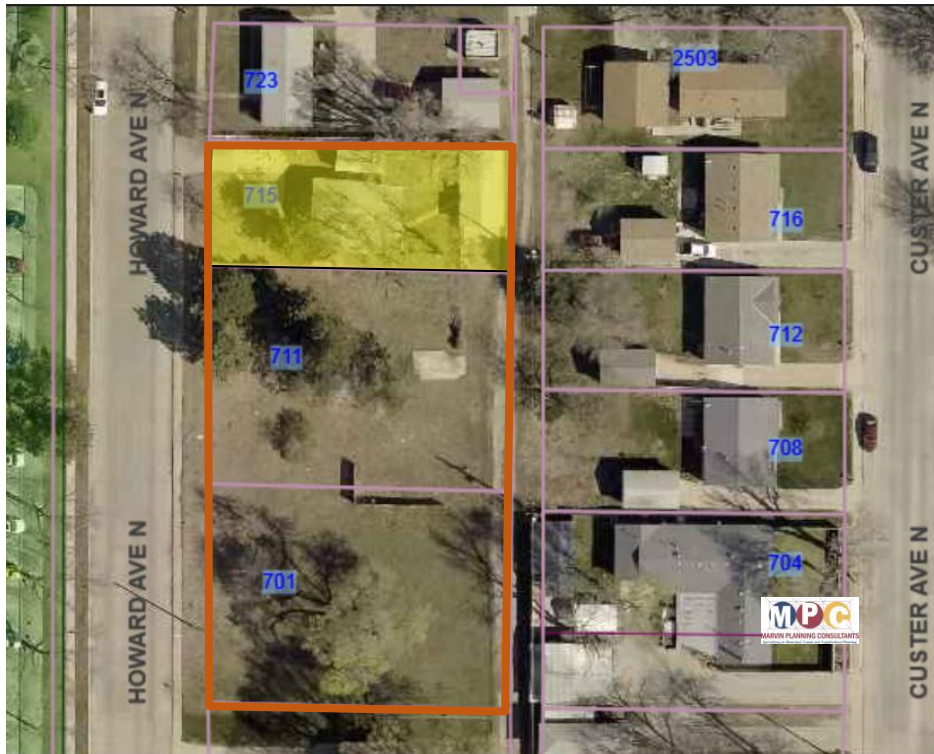
Figure 2 Existing Land Use Map