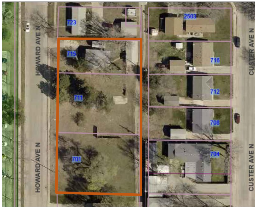
Figure 1: Study Area Map