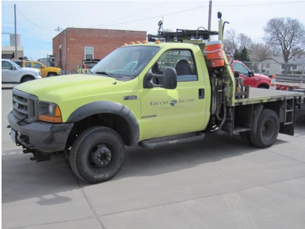
Profile, Exterior 1