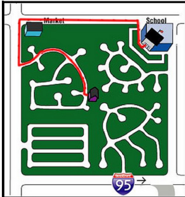
Driving-only transportation pattern

i Connected Routes: Points where multiple modes of transportation interact within a transportation network.