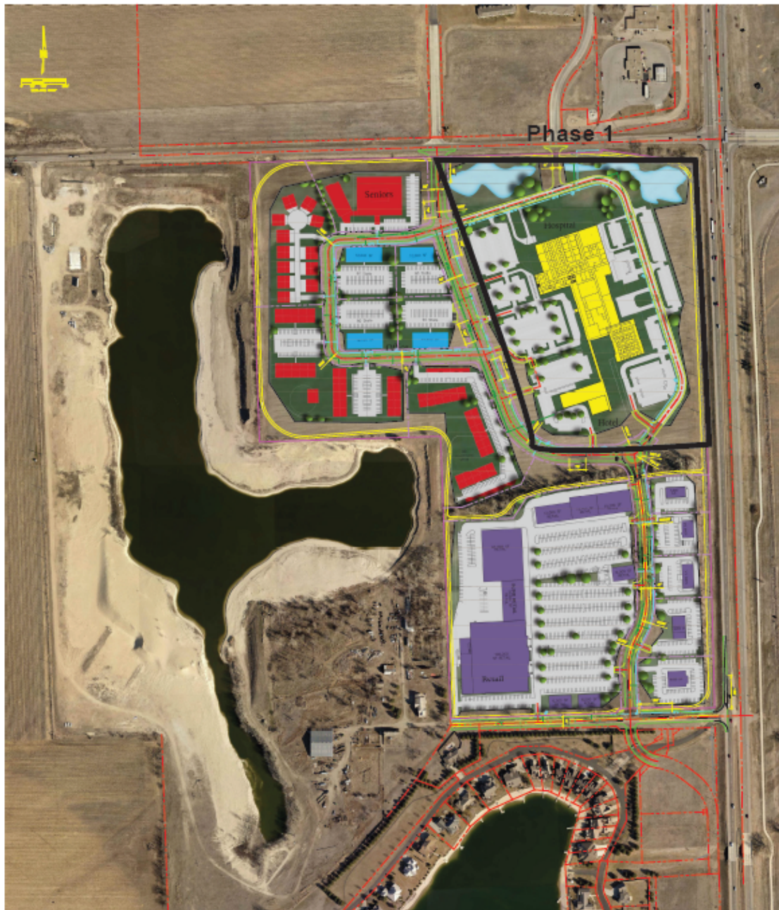
Proposed Site Plan as developed.