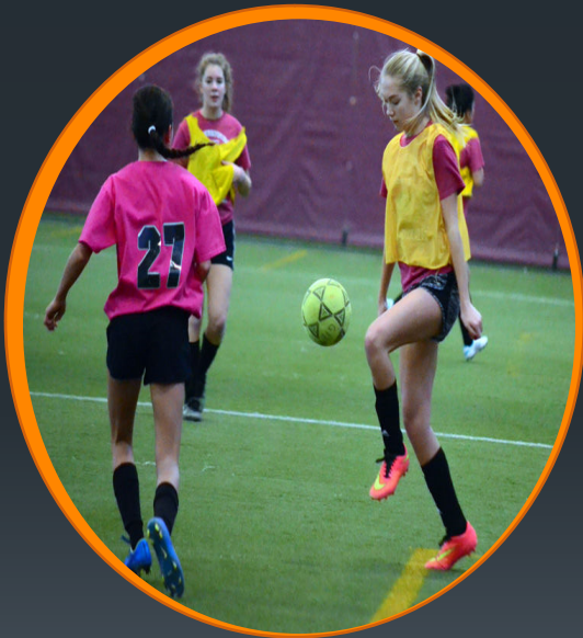
Community Field House