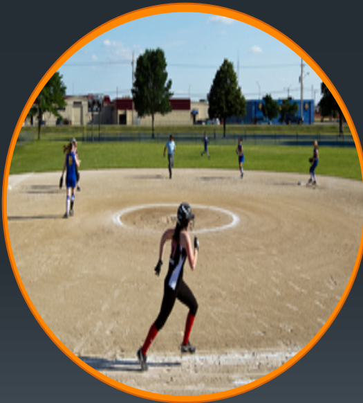
Veteran's Athletic Complex